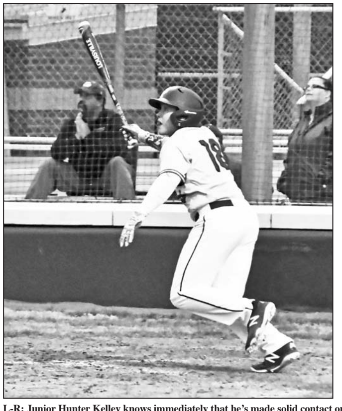
double that capped a three-run rally in the seventh inning.